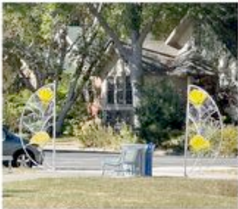
The Milligan Studio, Ginkgo/Light , 2024, stainless steel and kiln-formed fused glass.