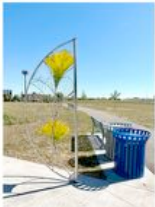
Ginkgo/Light (det.)

At the corner of Emerald Street and Myrtle Avenue a new public artwork, Ginkgo/Light , now welcomes visitors to Westgate Commons Park . This park in the St. Anthony Park neighborhood is a recent addition to the City of Saint Paul's Parks and Recreation system. Bordering the Minneapolis neighborhood of Prospect Park, the one-acre park provides much-needed green space to an area that has added hundreds of new housing units and numerous businesses over the past decade.