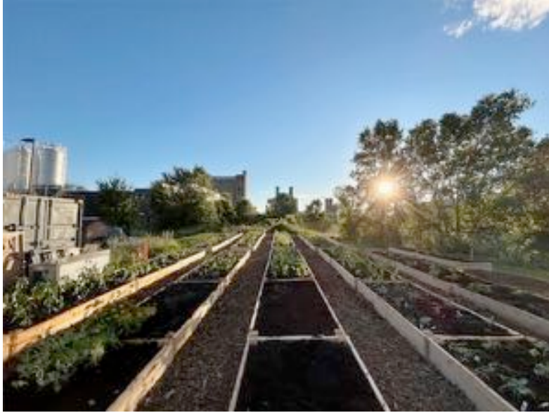
Surly garden beds with growing veggies

PPA and “Surly Gives A Damn” received a University Good Neighbor Fund grant for a community donation garden in Prospect Park.